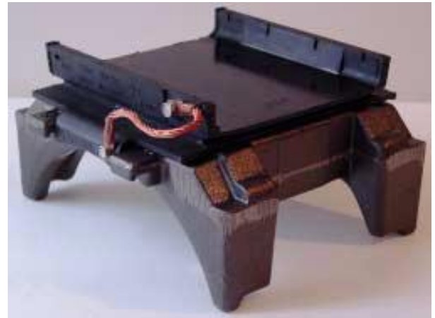
The Barber S2-86® Radial Adapter Assembly shown above (Item# 6374) is available for use on S-2-HD, S-2-HD-9C, and S-2-E Barber stabilized Trucks. The 6374 Assembly includes our 100-Ton Bearing Adapter (Item# 6366) and Shear Pad (Item# 6367).

Over the past four years, the Barber S2-86® Radial Adapter has been specified on thousands of freight cars for 286 GRL service. Along with excellent curving performance and the lowest rolling resistance of any semi radial truck adapter, the Barber S2-86® Radial Adapter offers superior durability and reliability (based upon lab and field results). Yet the entire unit is self-contained and directly replaces standard bearing adapters in-kind – no special side frame is required.