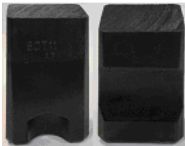
SCT-11 – 6000 Lb. Side Bearing Block For Use in 656-CR on 70 Ton Cars

Now available! Call your SCT Sales Manager for more details.