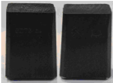
SCT-9 – 6000 Lb. Side Bearing Block For Use in 688-BR on 100 Ton Cars