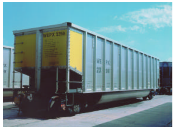
WEPX Car #2398

TwinGuard's exclusive qualities are provided in part by the Elastomide composition of the separate covers. Elastomide, developed in 1991, is a polymer based material that shows the highest tensile strength and heat resistance in the industry. In fact, it provides heat resistant protection up to 350 degrees F, more than 150 degrees greater protection than the RFE Polyester Polyurethane based products.