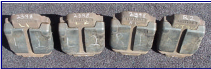
TwinGuard Wedges after 507,824 miles

Typical polymer cover friction patterns are shown in the following photograph of in-service wedges after 507,824 miles of service.