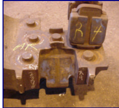
507,824 miles & zero pocket wear

TwinGuard offers unparalleled protection for pocket wear. It effectively eliminates bolster pocket wear. This wedge outperforms all other plastic-backed wedges, providing twice the protection and delivering twice the impact to performance – eliminating component wear and providing hunting stability.