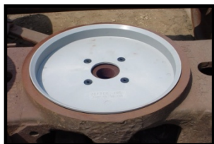
ZT-350, 16" Full Bowl Liner for 2" deep bolster bowls.

ZefTuf® CFR-P (Cold Flow Resistant-Premium) Material