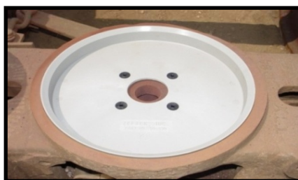
ZT-351, 16" Full Bowl Liner for 2-1/4" deep bolster bowls.