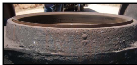
Bowl after 600K+ Service Miles

Contact your SCT Sales Manager today and specify the ZefTek ZT-351 Bowl Liner for your next car build – and incorporate the ZT-351 into your maintenance program for bowl liner replacement.