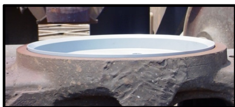
Example of New Bowl Liner in Bolster

The optimum friction properties of our ZefTuf®CFR-P material provides the ideal balance of curving and high-speed stability while demonstrating incredible resistance to wear and cold flow or creep. After 600K+ miles, inspection of the bottom and side walls showed less than 5% loss of the original thickness compared to new liners.